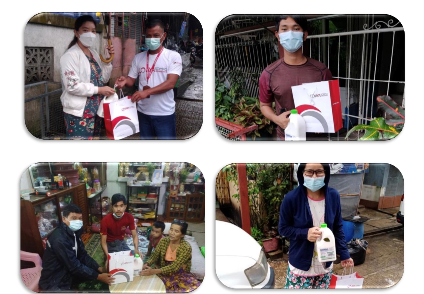
AYA SOMPO Insurance's community support initiatives during the Covid-19 pandemic period in Myanmar

during the peak of the 3<sup>rd</sup> Wave of Covid-19 in Myanmar between the months of June and July 2021. The initiative is employee led and provides support to colleagues and families adversely affected by the pandemic. The CRRCP is an ultimate success and received seed funding from the company to ensure continued provisions for successive outreach.